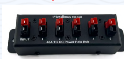
Intellitron PDC-3506 40A Powerpole Hub