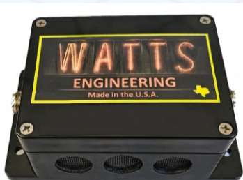
Watts Engineering Black Beauty Broad 160-10 Common Mode Choke

6 DOOR PRIZES! You must be present to win